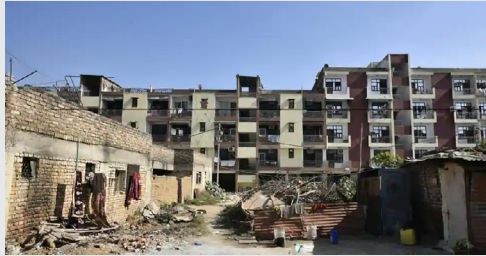
Unauthorised colonies — that house nearly four million people — are an integral part of the city and can't be ignored, urban planning experts said.