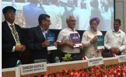
Training Modules developed by SCBP team endorsed by MoHUA

Sanitation Capacity Building Platform (SCBP) is an NIUA initiative to address urban sanitation challenges in India. It is supported by the Bill & Melinda Gates Foundation. It aims to promote non-sewered sanitation solutions for septage and wastewater management. The platform lends support to the Ministry of Housing and Urban Affairs (MoHUA), Government of India through capacity building programmes and providing inputs to policy initiatives. It supports states and cities to move beyond the open defecation free (ODF) status by addressing safe disposal and treatment of faecal sludge and septage. In addition, SCBP works in close collaboration with the National Faecal Sludge and Septage Management (NFSSM) Alliance. For more information on the project, visit here .