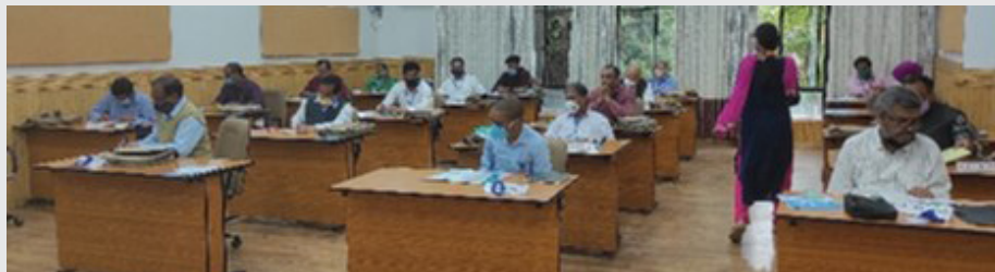
SCBP team conducts a capacity building workshop for Uttarakhand's ULB officials