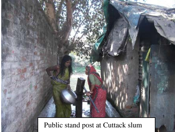
Public stand post at Cuttack slum

The main objective of the project is to develop citywide sanitation plans for eight cities viz. Bhubaneshwar, Puri, Cuttack, Berhampur, Sambalpur, Rourkela, Balasore and Baripada , implement them by integrating all aspects of sanitation